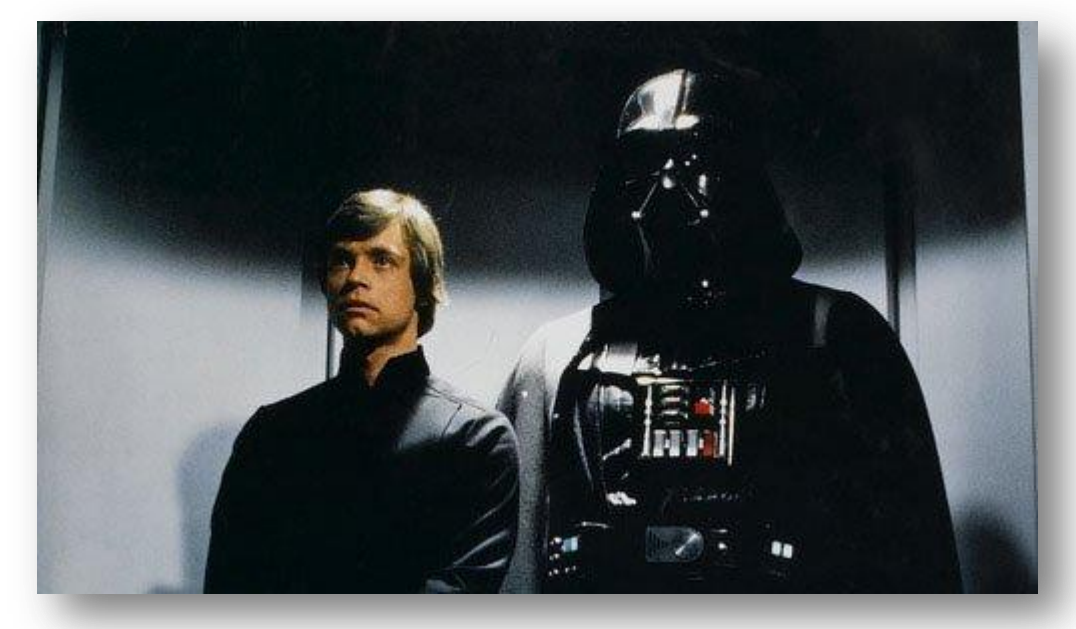
Don't let this be you with your boss – especially if he is your Father!